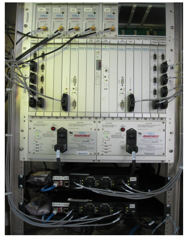
E-ZPass "Badger" Tag Reader on MD 200. Visible in the bottom of the picture are the network serial converters used to connect the radio to the lane controller hardware.

Several E-ZPass documents referred to space on the tag for storing the entry point for closed-toll systems (i.e. "take a ticket at the beginning and pay what it says at the end" systems), however, the documents that we saw do not indicate whether this is a feature of the current system or only a feature that they wish they had but currently do not have. If this feature does exist, we need to determine whether it is vulnerable to changes, so that, for example, a malicious user could switch the tag to say a different entrance than the one which the vehicle actually used in order to pay a lower toll.